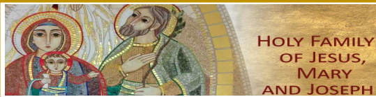
HOLY FAMILY OF JESUS, MARY AND JOSEPH