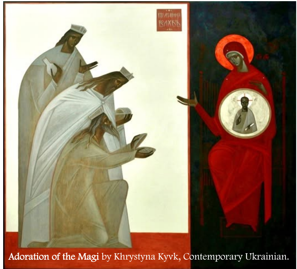
Adoration of the Magi by Khrystyna Kyvk, Contemporary Ukrainian.